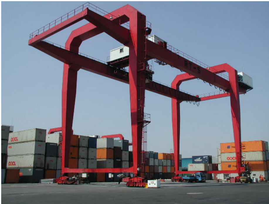
Fig 14: Rail Mounted Gantry

However, many small span RMGs are in used in railway containers to and from rail wagons. The increase in rail transportation of containers will lead to a wider use of the small span RMG as a special purpose machine for rail terminals.