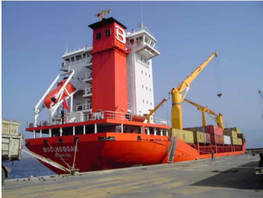
Fig 2: Shipboard Slewing Jib Crane