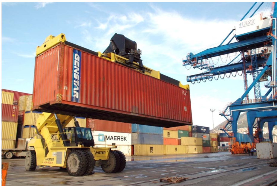
Fig 13: Reach Stacker

The reach stacker is particularly suitable for intermodal terminals where two or more rail lines running in parallel could be accessed by the reach stacker from the side, a feat which the FLT is not able to emulate.