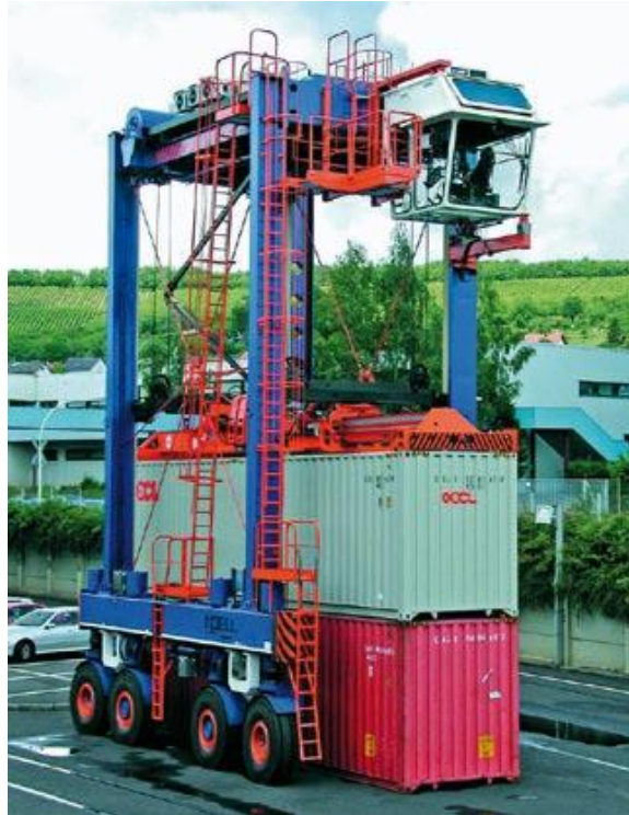
Fig 9: Straddle Carrier

Though there are compelling reasons for small terminal's to subscribe to the straddle carrier system, in practice it has not been so. Some possible explanations are as follows: