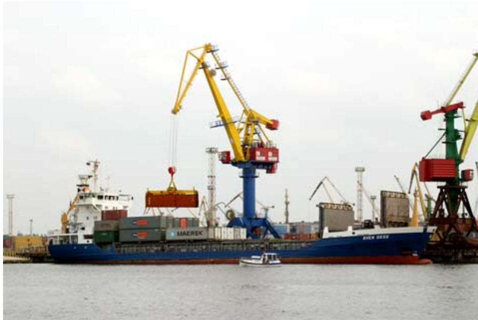
Fig 6-Multipurpose Slewing Crane