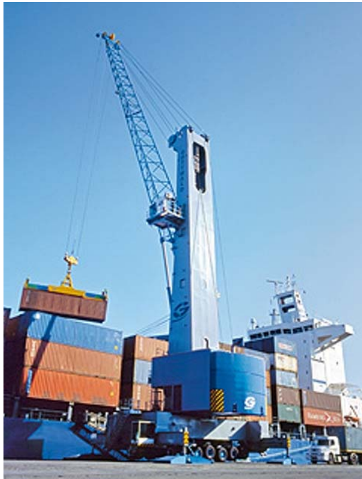
Fig 7: Mobile Harbour Crane

These are specially designed mobile cranes for ship to shore handling and harbour duty. They are usually multipurpose machines capable of being adapted with hook, spreader or grab (Fig 7).