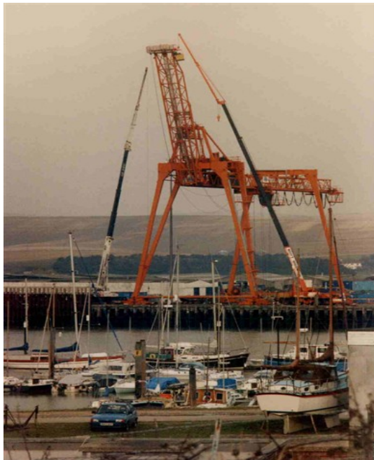
Fig 5: Light Weight Gantry Crane

Examples of this type of crane are the Tango and Samba Series of Sea Container design. Lift capacities of Tango and Samba cranes are respectively 30t at 24.3m and 35t at 35m outreach with smaller corner loads, viz, 6 x 26 ton for Tango and 8 x 23.5 ton for Samba, there is less need for expensive civil works.