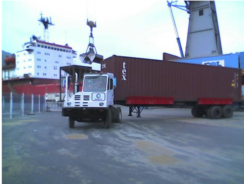
Fig 8: Tractor-Trailer

The tractor/ trailer combination at a cost of US$50,000 to US$60,000 a piece is an economical means of transportation equipment.