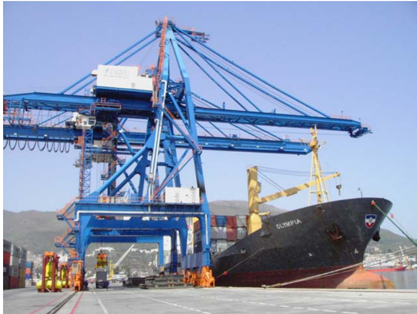
Fig 4: Quayside Gantry Crane