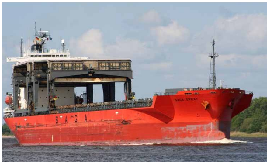
Fig 3: Shipboard Gantry Crane

Some ships are equipped with shipboard gantry cranes which can travel along the length of the ship. The crane's top girder has an articulated boom which extends over the shipside and enables containers to be lowered on to the shore. Other design incorporates a slewing boom which could be fixed pedestal mounted on the gantry or trolley mounted for cross travelling on top of the gantry. Shipboard gantry cranes have a higher handling capacity of 20 to 25 boxes an hour.