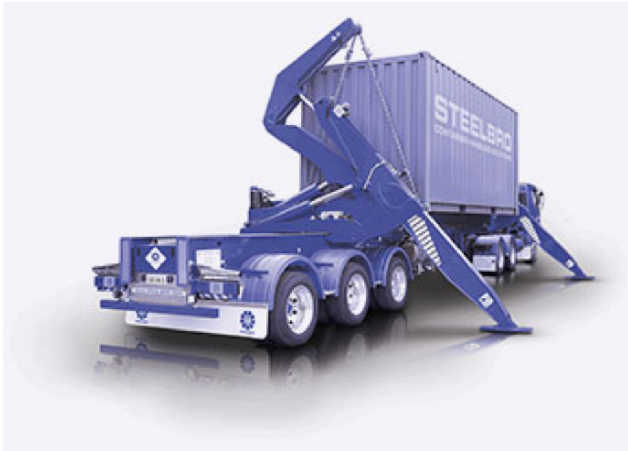
Fig 10: Self-Loading Trailer

This machine performs the functions of loading, unloading and on-highway transportation. Since it is a self-contained unit, it can work independently of cranes and FLT's and hence could be deployed to remote destinations where unloading equipment are not available. The self-loading trailer is therefore ideal equipment for container haulage companies located in the less developed countries. In these countries, most of the receivers and shippers of goods do not have elevated platform for stuffing and unstuffing chassis mounted containers. The self-loading trailer unloads the containers on the ground and goes on to make another delivery, while the receiver could take his time to unstuff the container, using it as a warehouse temporarily.