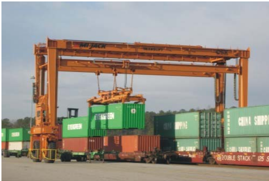
Fig 12- Medium Span Gantry

The MSG provides a stacking density that is between a straddle carrier and a wide span RTG. Maintenance of the machine is simpler than the RTG, however frequent maintenance work is required owing to its hydraulic drive machineries. Capital cost of about US$350,000 to US$400,000 per unit gives a quick payback for the buyer.