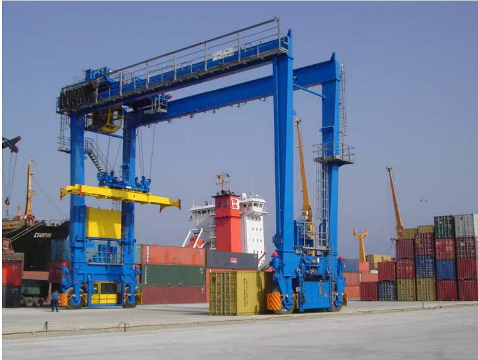
Fig 11- Rubber Tyre Gantry

according to the amount of yard space available. It is certainly a lesser evil to live with lack of containers selectivity than to turn away containers because of shortage of yard space.